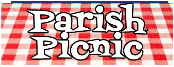
Celebrate Mass on the Grass at 11AM

Following Mass, enjoy burgers and fries from The Habit and pizza from Tower Pizza*, drinks (for purchase), and an assortment of delicious desserts. Games and other activities for kids of all ages! Come spend sometime in fellowship with school families and parishioners alike.