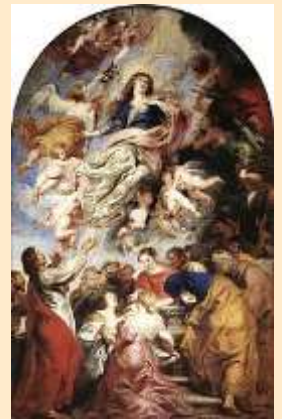
The Assumption of Mary, Rubens, circa 1626

The New Testament contains no explicit narrative about the death or dormition, nor of the Assumption of Mary, but several scriptural passages have been theologically interpreted to describe the ultimate fate in this, and the afterworld of the Mother of Jesus. Various apocryphal documents do contain narrations of the event. (SOURCE: WIKIPEDIA).