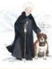
SAINT BERNARD & HIS DOG