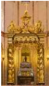
Cathedral of Gniezno

Courageous men like Saint Adalbert don't just happen. They are forged over time in red hot fires. Adalbert had a long, difficult, and interesting ecclesiastical career before giving his life for the faith. But he was so impressed with the saintly German Bishop named Adalbert who taught him, that he took his tutor's name at Confirmation.